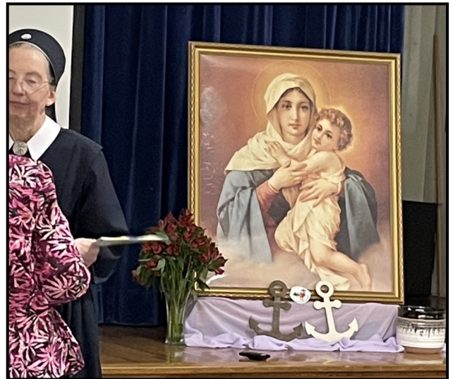
Picture of "Mother Thrice Admirable" with anchors of hope at the feet of Jesus. A few meanings from the picture: Mary is pointing to Jesus, the white headpiece is wrapped around both Mary and Jesus meaning their mission belongs together, Mary is holding Jesus over her heart.

Thank you to all of those who helped make this a successful retreat!