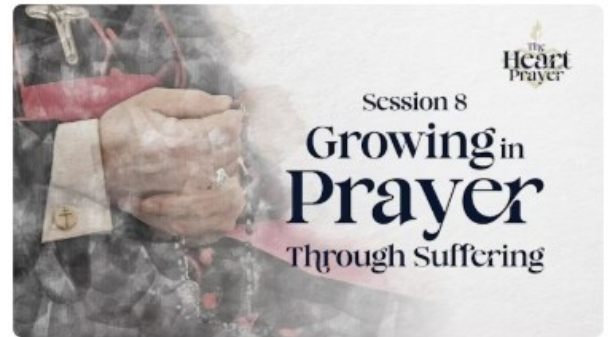
Growing in Prayer through Suffering | Heart of Prayer | Episode 8