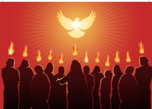
PENECOST SUNDAY MAY 19,2024